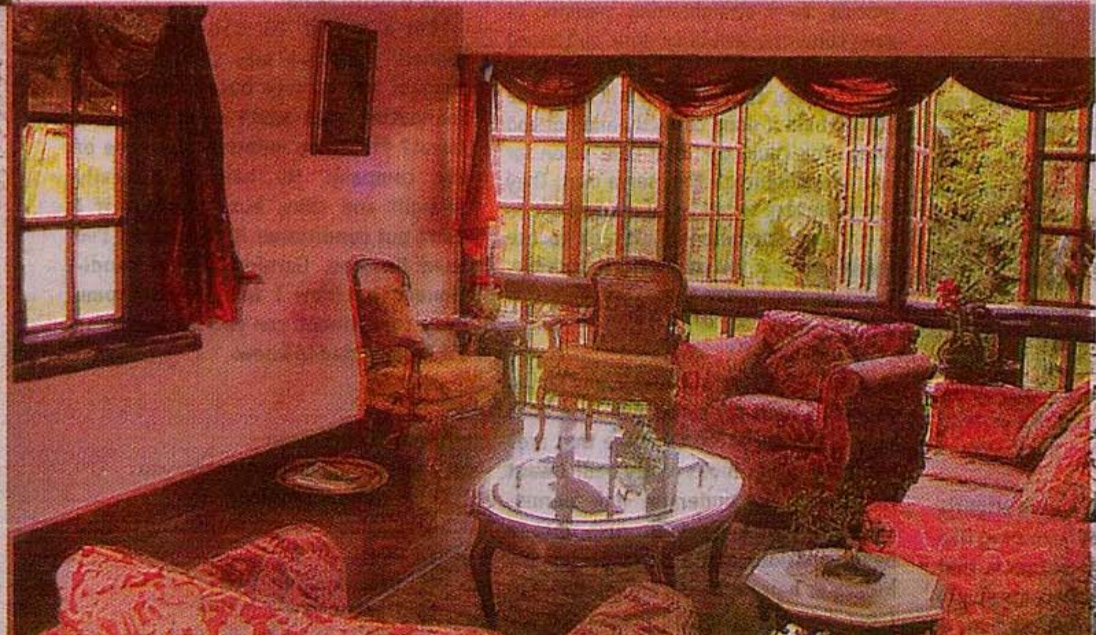
RAFFAT BINTE RASHID

Both the facilities are highly recommended for their picturesque landscape.