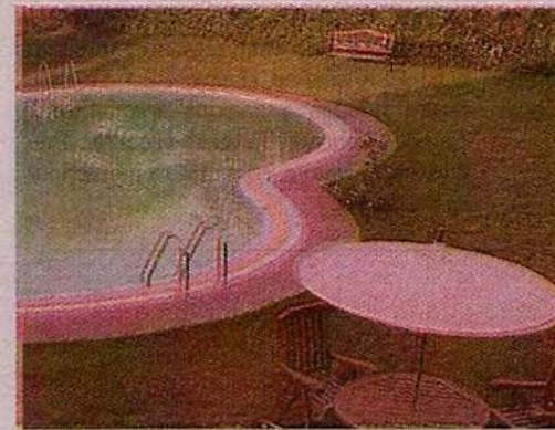
RAFFAT BINTE RASHID

the largest markets for mangoes in Bangladesh. Enjoying mangoes to one's hearts desire is an added advantage. Although the heat may be one of the reasons to back off, the transport is air-conditioned and the package includes all meals and accommodation at twin sharing basis. The cost of the package is Tk.3750. Enrollment for the package starts right away and it is scheduled to start on the