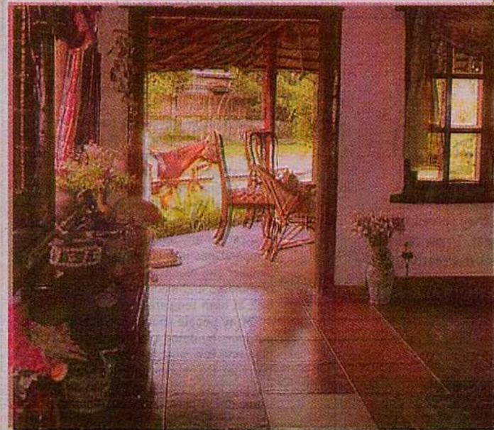
RAFFAT BINTE RASHID

All three packages arrange for your arrival at Bandarban, after which you are transferred to the Hillside resort. The trip to Chimbuk starts after lunch, and on the way back, there is a stop at Shailapropat, a place of pleasant scenic beauty and river rapids. Located around here is a village where the people of the Bawm tribe live.