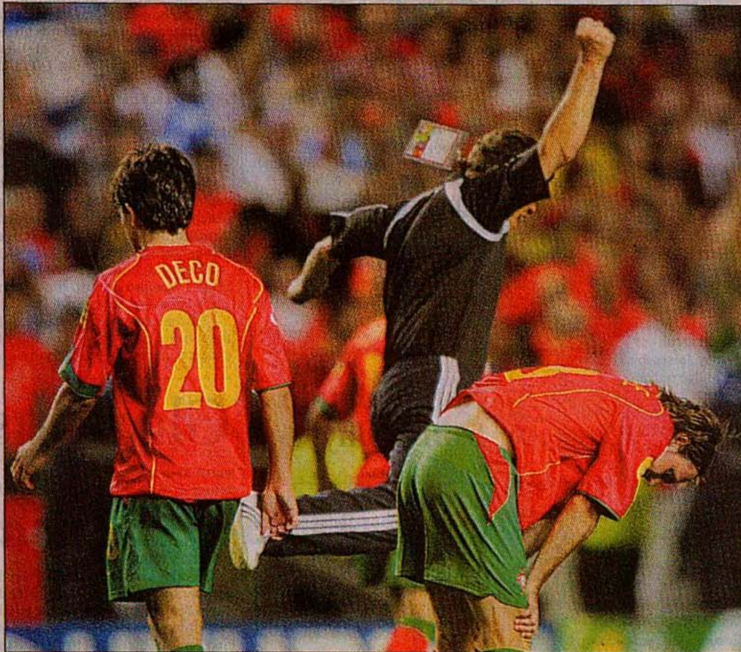
OTTO-GEAR AT FULL THROTTLE: (L) Greece's miracle-making coach Otto Rehhagel (C) has suddenly rediscovered the spring of a 15-year old in his steps as he sprints towards his players past distraught Portuguese booters with fist pumping the air after the final whistle. (R) The Greek legends parade with the trophy.

After insinuations that German referee Markus Merk would be