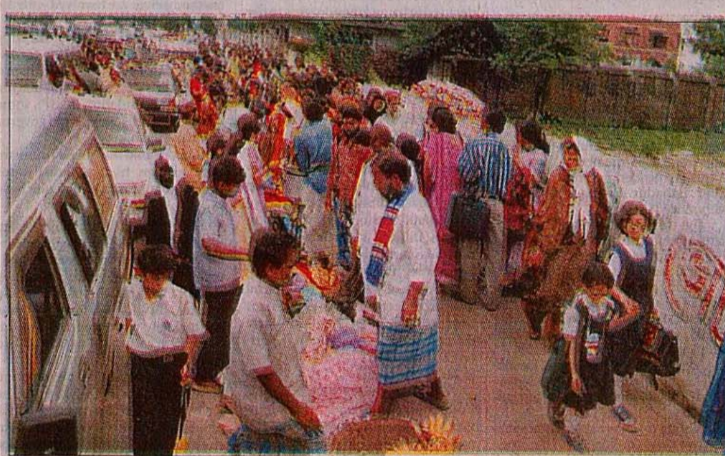
Thanks to hawkers and mindless car parking, students of Willes Little Flower School and their guardians have to fight their way through a human congestion along the footpath every day.