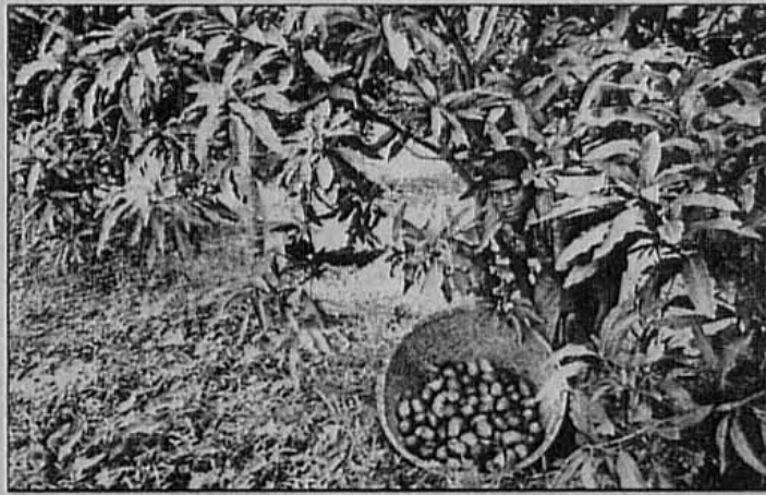
A partial view of Abdullah Omar's Amroploi garden and plucked mangoes.

"This will allow local youths to get practical training on farming, fishery and horticulture. A large number of unemployed youths will also get jobs in my farm" Omar said.