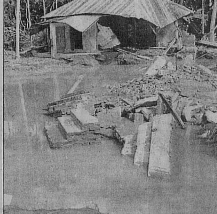
Hazipur Union Parishad office in Kulaura upazila, Moulvibazar collapsed during a recent flood there.

The clash ensued when Modon Mia attacked Monir Mia when he was cutting bamboo in the land. Both the groups armed with lethal weapons locked in the clash sustaining injuries to 20 persons.