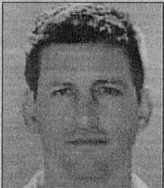
Michael Kasprovic (Australian fast bowler)

"Being in the Australian team is all about opportunity and there's a lot of great cricketers in and around the Australian first-class scene and for me having played before and tasted it I was pretty keen to get back and by doing well I can hopefully cement that spot."