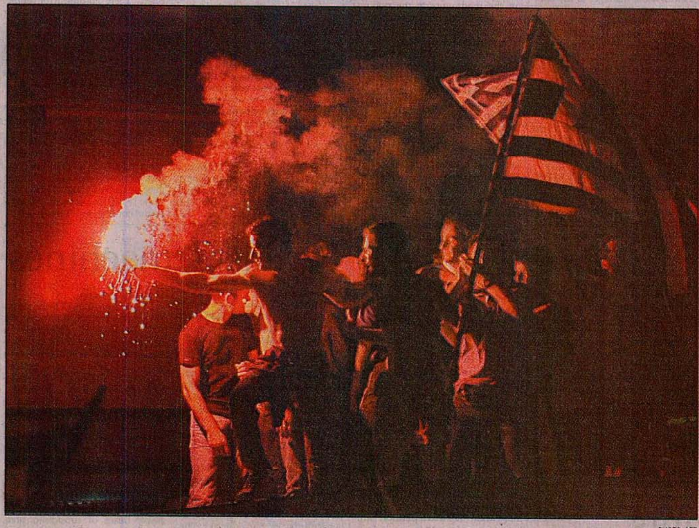
KEEP THE FIRE BURNING... Greek fans light flares as they celebrate in the centre of Athens after the national football team defeated the Czech Republic in the second semifinal of the Euro 2004 on July 1.

president, who ruled his country with an iron-fist for 24 years, was in full command in court on Thursday. Saddam "is a strong and steadfast man. He enjoys a strong sense of the law and dominated the court and confused the judges," he said. In court, the 67-year-old former dictator refused to sign legal papers after the charges were read against him, demanding the presence of his lawyers. Saddam dismissed the court as "a theatre", denounced US President George W. Bush as the "real villain", defended his invasion of Kuwait and called Kuwaitis "dogs". ROCKETS HAMMER HOTELS Rockets hit two central Baghdad hotels yesterday, shattering the Muslim holiday calm a day after Saddam appeared before the Iraqi tribunal. The explosions woke residents of the capital who had been riveted by the drama of a deflated but still defiant Saddam brought in chains to SEE PAGE 11 COL 8