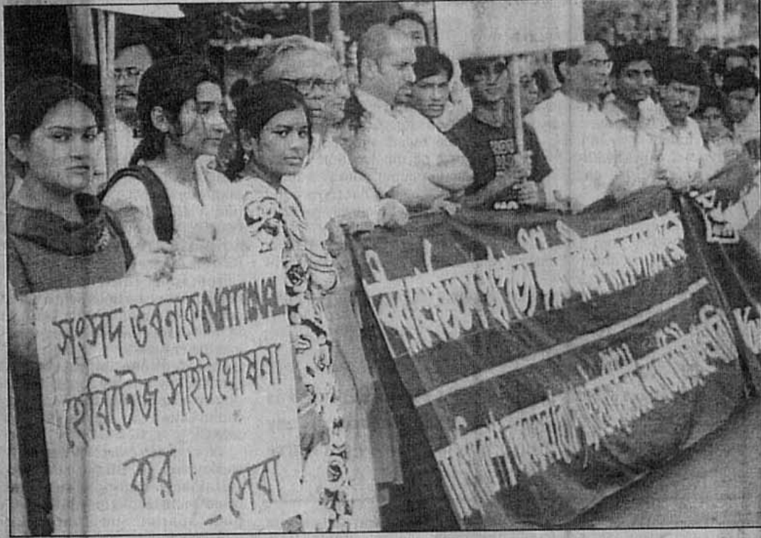
Bangladesh Paribesh Andolon and the Institute of Architects, Bangladesh form a human chain at Shahbagh in the city yesterday demanding that the Jatiya Sangsad Bhaban be declared a national heritage site.