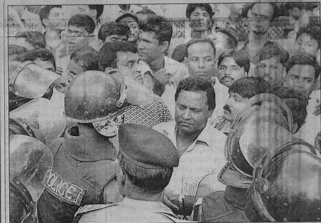
Police prevent the leaders and activists of Jubo League from marching through the city as the demonstrators tried to bring out a procession from Muktagang demanding cancellation of Dhaka-10 by-polls and arrest of those involved in the bomb attack on an Awami League rally at Sunamganj.

Light to moderate rain or thundershowers accompanied by temporary gusty wind is likely at a few places over Chittagong and Sylhet divisions and at one or two places over Rajshahi, Dhaka, Barisal and Khulna divisions during the next 12 hours till 6.00pm today. Day temperature may remain nearly unchanged during the period, Met Offices said. Yesterday's highest temperature of 36.4 degree Celsius was recorded at Jessore and the lowest of 24 degrees at Srimangol. The sun sets in the capital at 6:50pm today and rises at 5:16am tomorrow. The highest and lowest temperature and humidity recorded in some major cities and towns yesterday were: City/Town Temperature in Celsius Humidity in percentage Max Min Morning Evening Dhaka 33.4 27.6 79 82 Chittagong 31.8 26.5 82 92 Rajshahi 33.6 28.1 83 74 Khulna 34.6 27.7 75 67 Barisal 33.6 27.5 73 69 Sylhet 32.8 25.4 83 69 Cox's Bazar 34.4 26.4 78 79