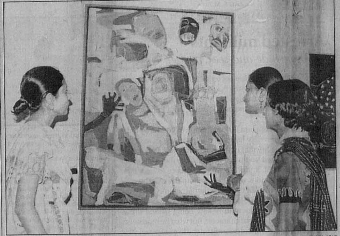
Visitors at the 15th Young Artists' Art Exhibition that began at the National Art Gallery at Shilpakala Academy in the city yesterday. The exhibition will continue till July 22.