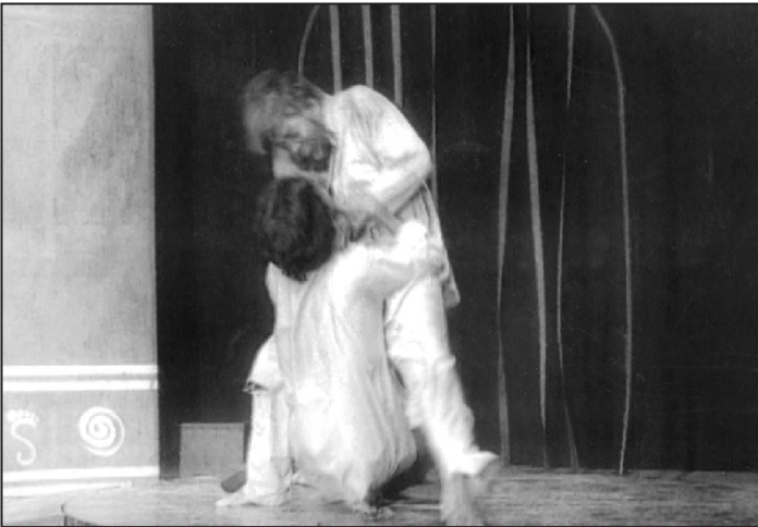
A scene from the play Tahader Katha

The use of two comic characters-a magician and his sycophant-as the relief in the tragic play is successfully handled by the