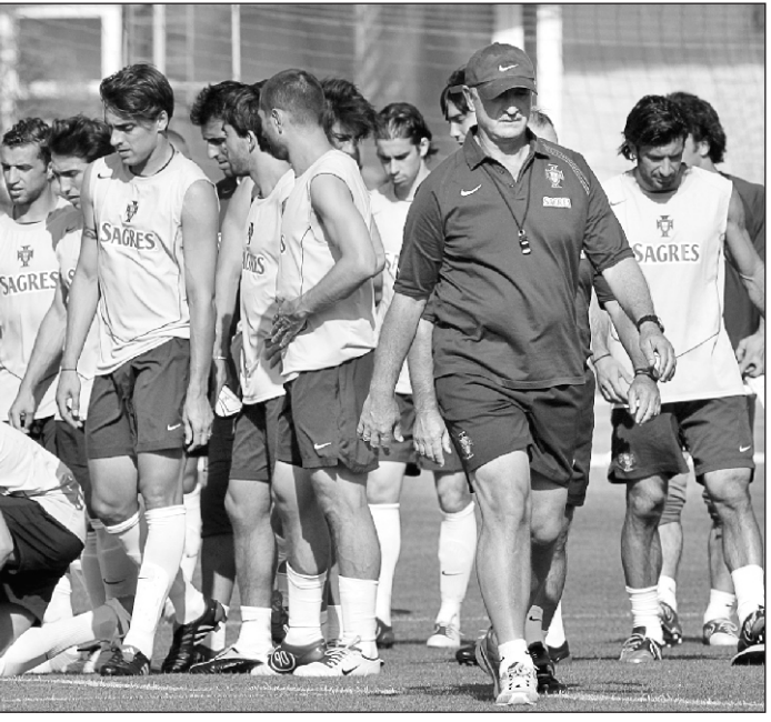
(L) A STEP AHEAD ALWAYS: Portugal's Brazilian coach Luiz Felipe Scolari moves away from a group of players during a training session at the Academia Sporting near Lisbon on June 28. (R) A DICK-TATOR? Dutch coach Dick Advocaat (second from R) constantly walks a thin line as he tries to get his highly talented yet egotistical squad (seen here in training on June 28 in Lisbon) to play as a team and more importantly win.