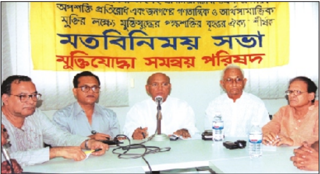
Awami League Presidium Member Tofail Ahmed exchanges views on 'resistance to fundamentalist forces and greater unity of pro-liberation forces' at a meeting organised by Muktijoddha Samannoy Parishad at Forhad Auditorium in the city yesterday.

They also recovered 13 firearms and 24 bullets and filed eight cases against 15 people under the Arms Act, said a police headquarters release.