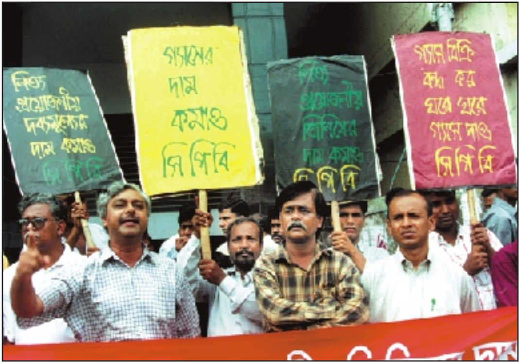
Communist Party of Bangladesh stages a demonstration in the city yesterday protesting the hike in prices of gas, electricity and other essentials.