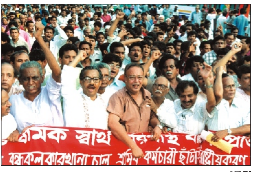
Sramik Karmachari Oikya Parishad took out a procession in the city yesterday demanding reopening of closed mills and factories.