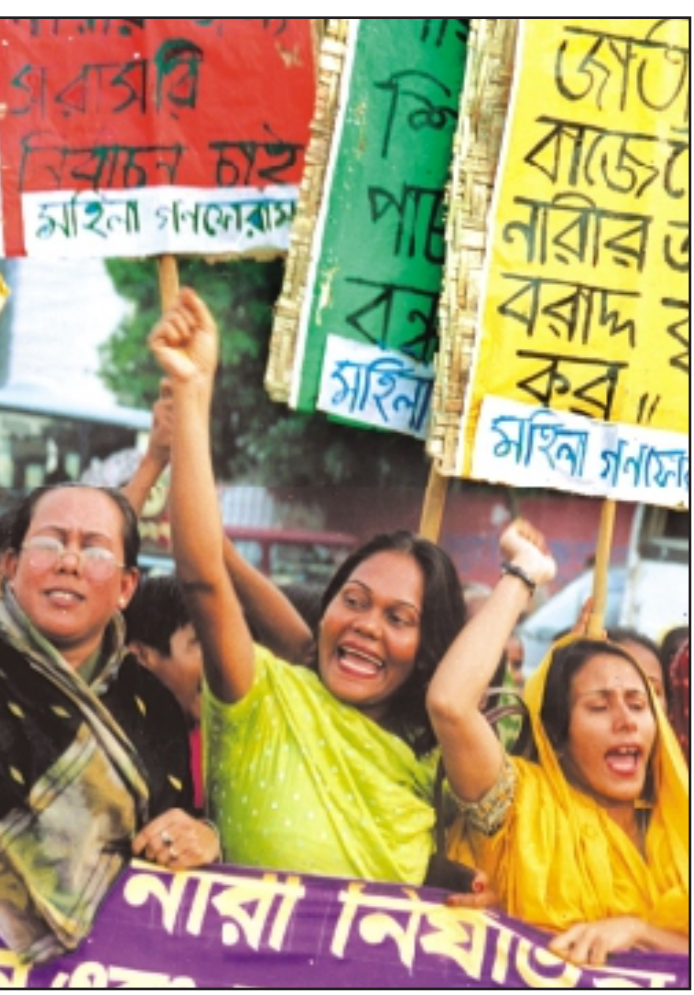
Mahila Gono Forum stages a demonstration in the city yesterday demanding direct election to the parliamentary seats reserved for women and an end to all forms of violence against women.

On the occasion, a milad mahfil will be arranged at his residence after Maghrib prayers.