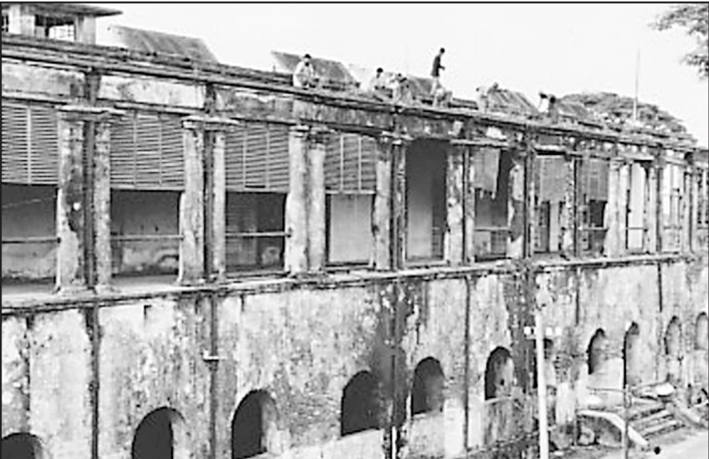
The old collectorate building in Barisal city (left) and the notice of the Department of Archaeology on its wall not to harm it in any way (right).

Meanwhile, the vested quarter, in collaboration with some unscrupulous officials and employees of the local PWD and the administration started a con-