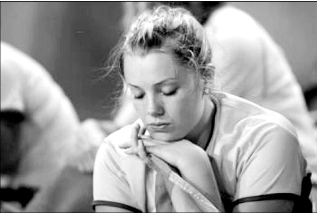
SOLITUDE IS THE ANSWER: A heart-broken Sweden fans sits in the stands after her team's exit from the Euro 2004.