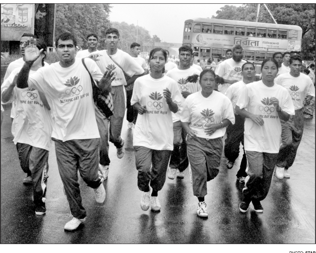
Participants of the Olympic Day Run jog through the capital yesterday.

England's 4-2 victory over Croatia earlier this week was the most watched sporting event in British history. All the signs were that Thursday night's match would beat that record.