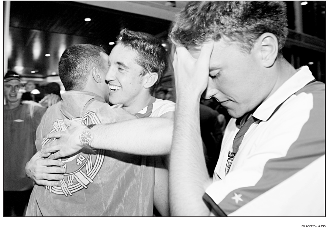
IT'S NOT THE END OF THE WORLD! A Portuguese supporter comforts an English fan after the hosts' victory on June 24.