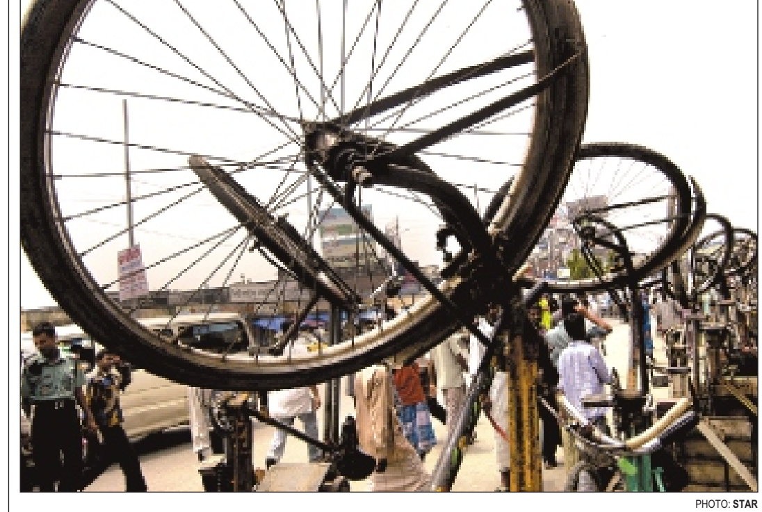
Illegal rickshaws pile up by the roadside as Dhaka City Corporation yesterday seized scores of them without licence in the New Market area.