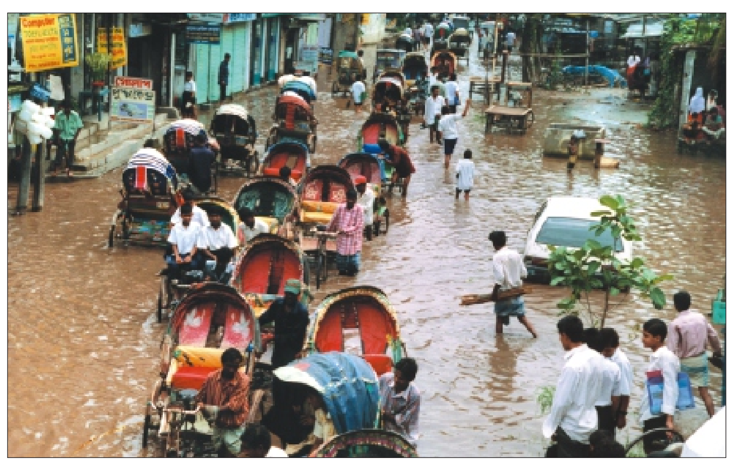
Waterlogging after days of torrential monsoon rains make a river of the road in East Dania on the eastern outskirts of Dhaka City. Local residents say they have been undergoing the same sufferings for years because of authorities' indifference.