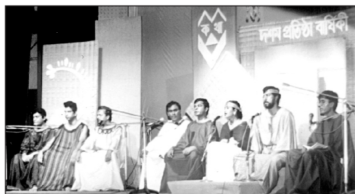
Recitation artistes performing at a show

The latest version of this group is to stage Prothom Partho by Buddhadev Basu. The objective of Katha is promoting recitation as an art form not only in our country but also beyond national boundaries.