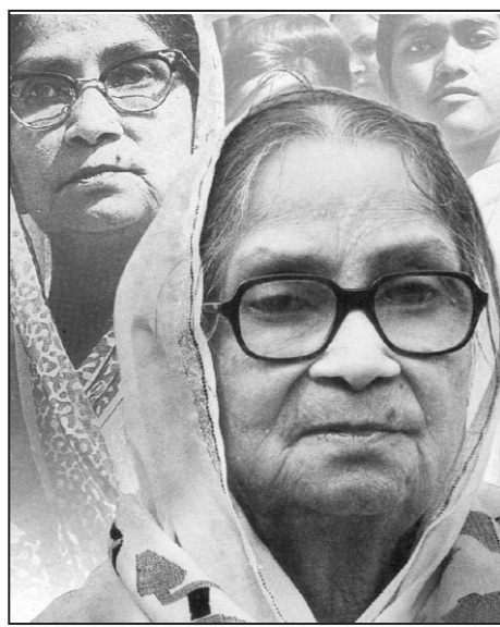
'We should proceed on the path where she started her journey'