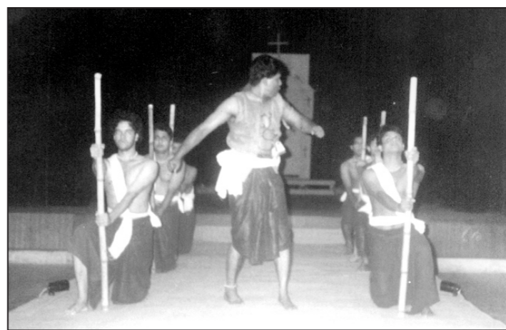
A scene from the play Birsa Munda