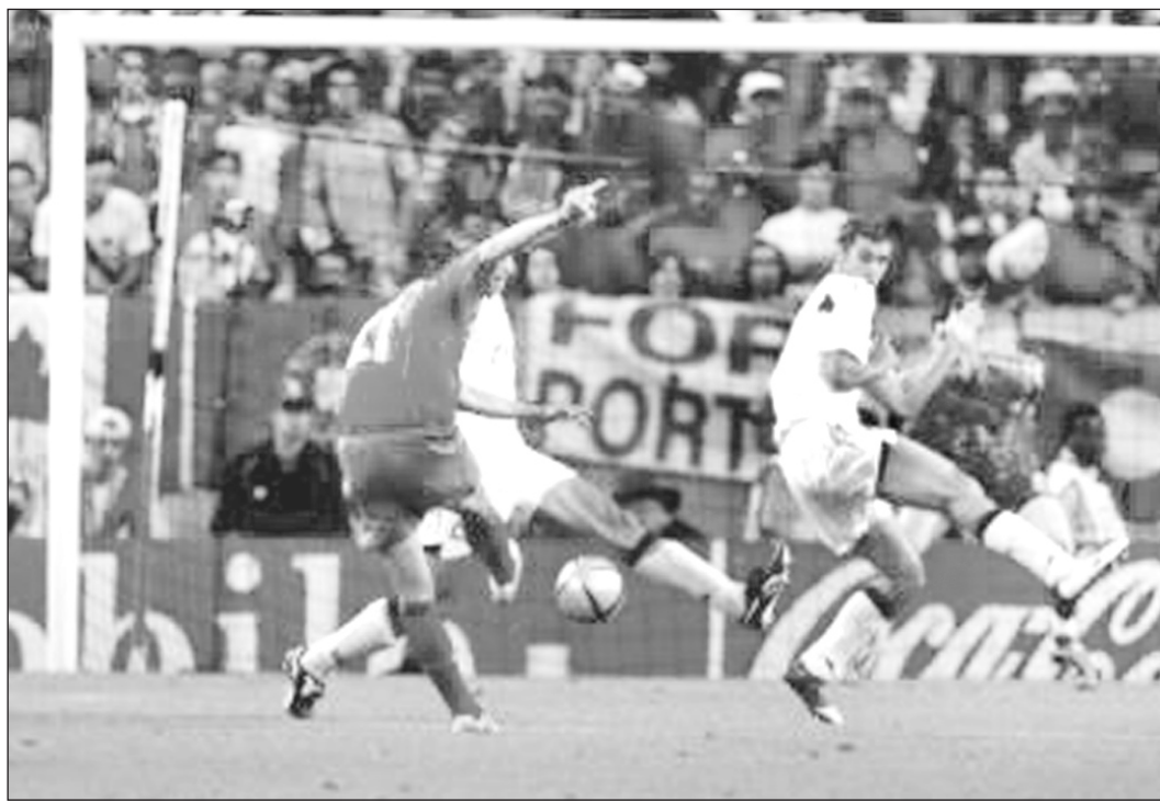
SEE YOU AT THE BACK OF THE NET! Portuguese striker Nuno Gomes delivers the killer punch against Spain on June 20.

"I'm going to savour the moment," he shouted over his shoulder as he ran the gauntlet of hordes of journalists afterwards.