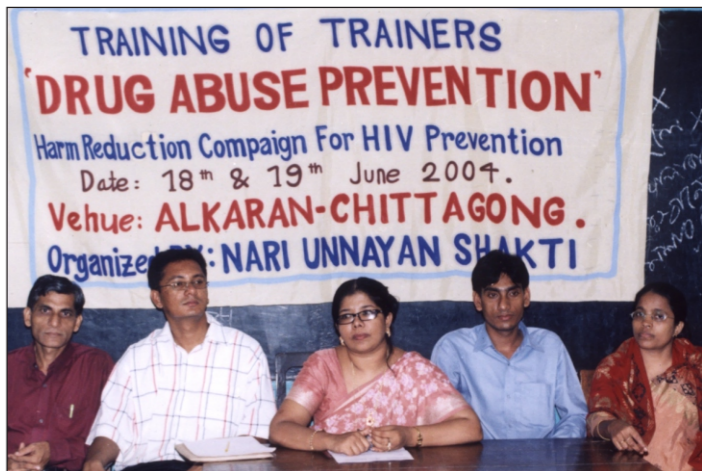
Nari Unnayan Shakti, a national NGO, organised two-day Training of Trainers (TOT) on 'Drug Abuse Prevention' on June 18-19 at Alkaran in Chittagong City. Twenty-five NUS staff participated at the training programme from its field offices in Chittagong.