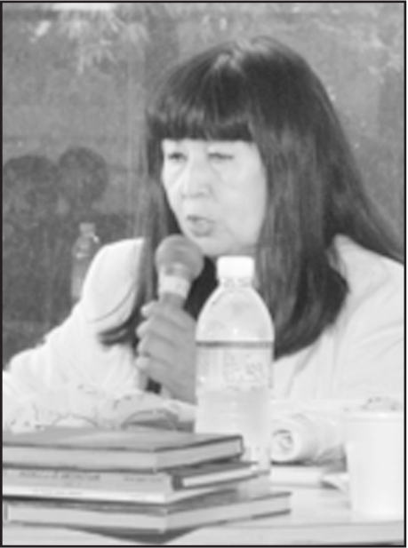
Japanese poet Kazuko Shiraishi