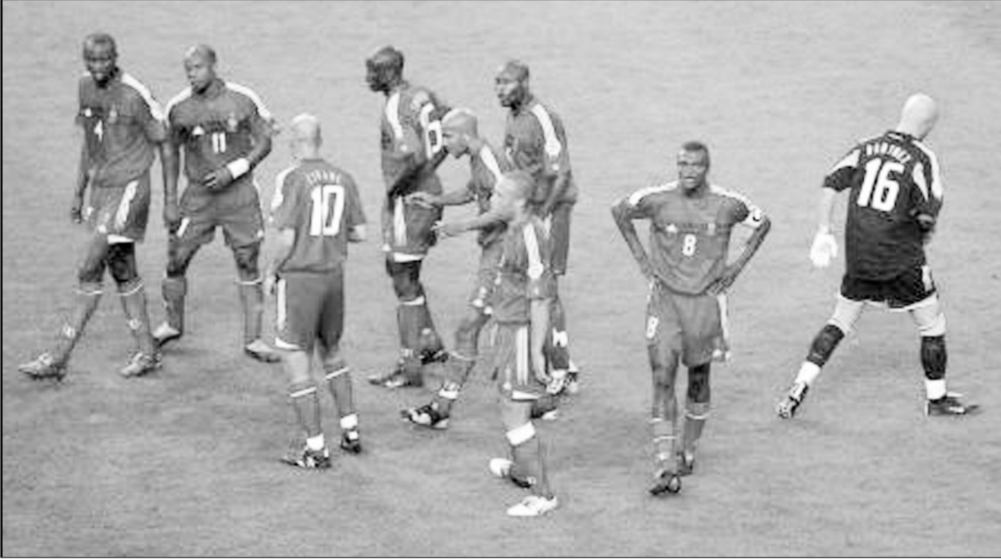
OH DEAR! French custodian Fabien Barthez (R) walks away from teammates towards his goal area after Croatia scored their second goal at the Magalhães Pessoa stadium in Leiria on June 17.