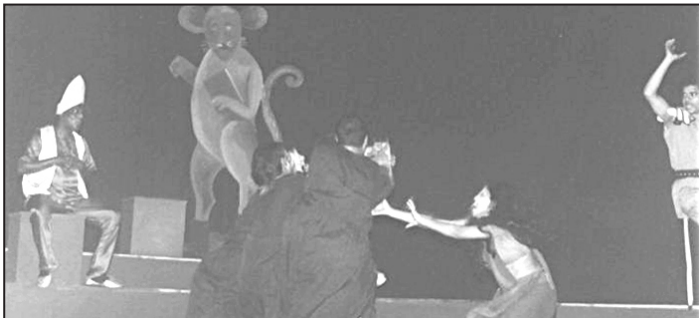
A scene from a puppet show at the end of the play

Dhaka Padatik's plays revolve around people who are struggling for their livelihood. SM Solaiman's satirical play Inggit is no exception to this trend. In the play, the dramatist focuses on people who confront social discrimination and calls for a change. In the play, he mocks our education system, politics, administration, cinema, and the government. The play ends with a satirical puppet show.