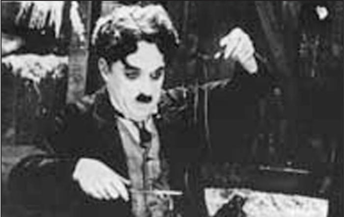
The mute art form for the 'little master' seemed to be the perfect medium

While explaining a pan shot, from Satyajit Ray's Apur Sansar ,