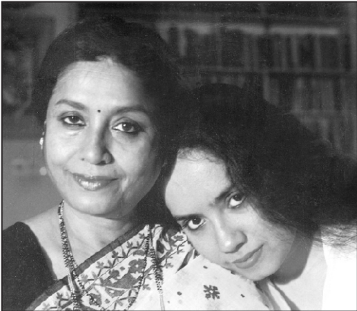
share the same stage with her.'