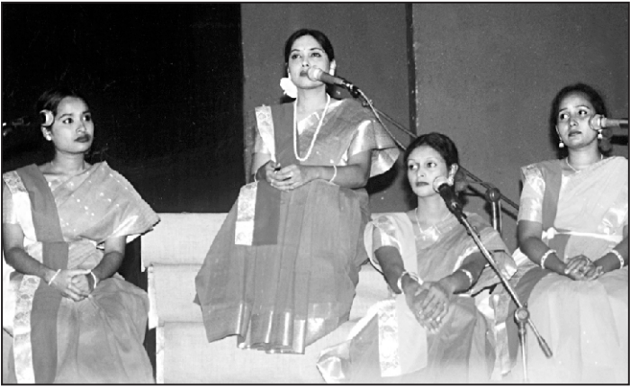
Kanthoshilon performers presenting Buddhadev Basu's Anamni Angana