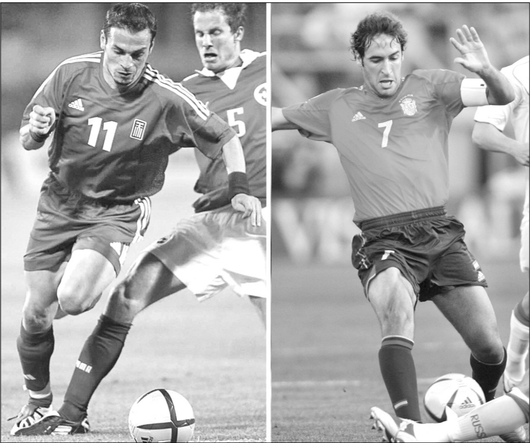
THE STAR CAST: A combo photo shows recent pictures of Greek forward Demis Nikolaidis (L) and Spanish forward and captain Raul. Spain play Greece in their second Euro 2004 Group A match in Porto today.

Gustavo Kuerten of Brazil and French Open champion Gaston Gaudio of Argentina pulled out last week because of injuries, although neither had been expected to make a big impact on grass.