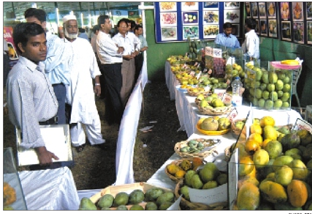
Visitors see around stalls at a three-day mango festival organised by the Department of Agriculture Extension that began on the Krishibid Institution premises in the city yesterday.