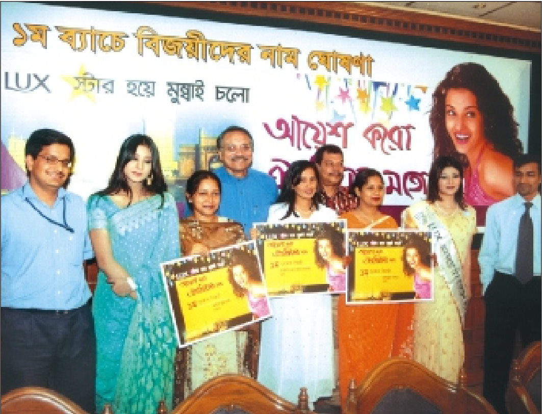
The three winners of a contest themed 'Be a Lux Star and Go to Mumbai, Live Like Aishwarya' pose for photos at a gala ceremony Lever Brothers Bangladesh Ltd organised at the National Press Club yesterday. (Story on Page 3)