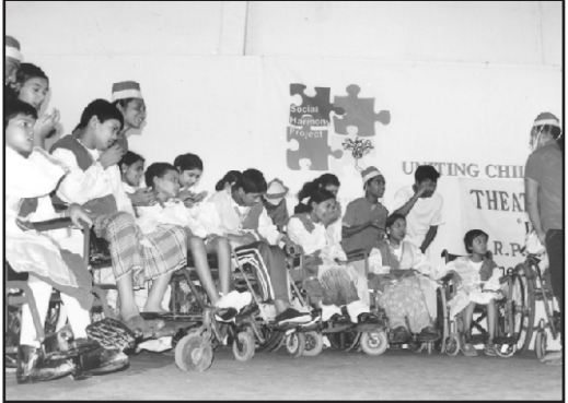
Physically challenged children showing off their enthusiasm and ability in acting

In the programme titled Look at Me , the children sitting in wheelchairs from CRP performed with the PTA children. The programme started with lighting up