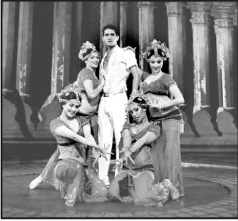
A sequence from Bombay Dreams

June 13 is a day for UK theatre goers to remember. After playing for two years at the Apollo Victoria Theatre in London, the curtains will come down on the famous musical Bombay Dreams .