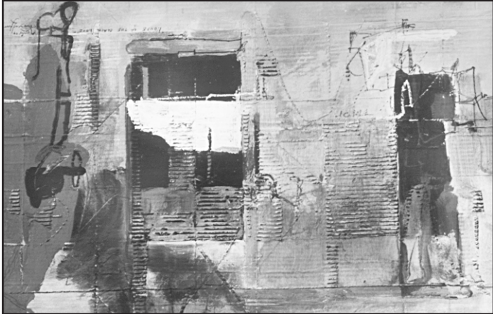
House of the Black Love, mixed media on box-board