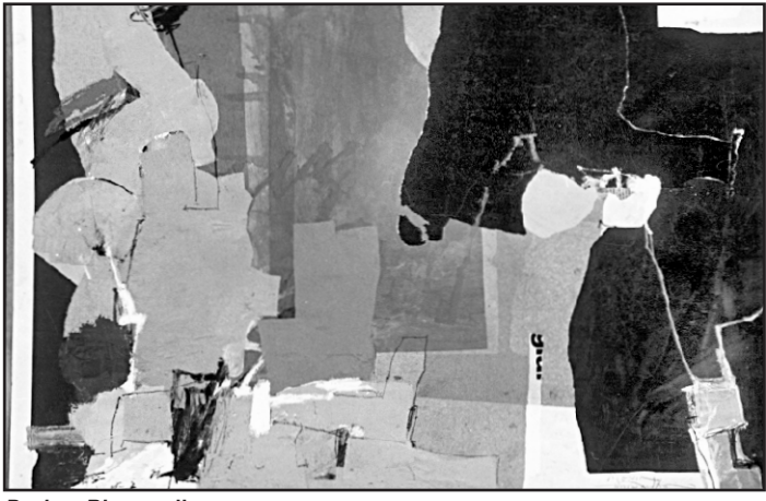
Broken River, collage