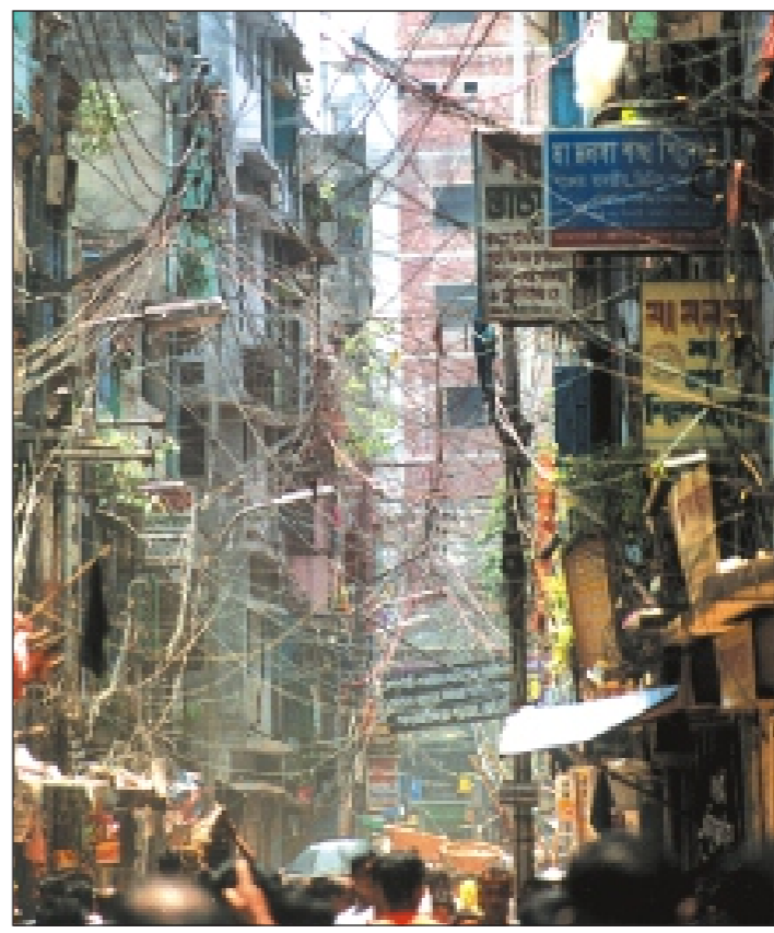
A hazy maze of electric cables hangs dangerously overhead on a narrow lane in Old Dhaka's Shankhari Bazar, posing serious threats of fire and electrocution.

al-Qaeda tape slams ME reform plan REUTERS, Dubai A top leader of Osama bin Laden's al-Qaeda network, in a purported audio tape aired yesterday, criticized a proposal for reform in the Middle East as a US ploy and said change will only come through "resistance." Al Arabiya television broadcast the brief recording which it said was from bin Laden's deputy Ayman al-Zawahiri, an Egyptian militant who Washington says played a major role in the September 2001 attacks on US cities. "America has nothing to do with SEE PAGE 11 COL 2