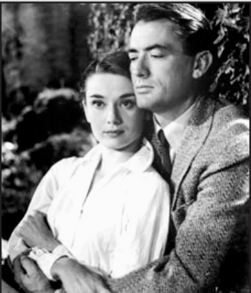
Audrey Hepburn and Gregory Peck star in Roman Holiday