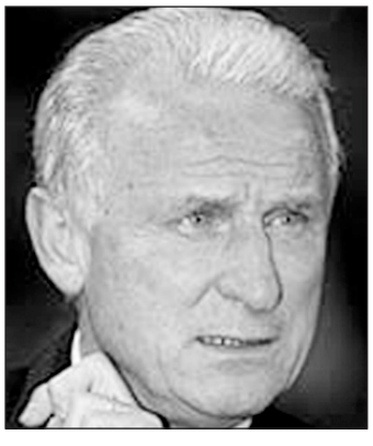
Giovanni Trapattoni (Italy soccer coach) "France won the European Championship thanks to Platini who gave them the added value of a gifted midfielder. Totti is similar to Platini in that respect. Maybe Italy has never had anyone as strong and