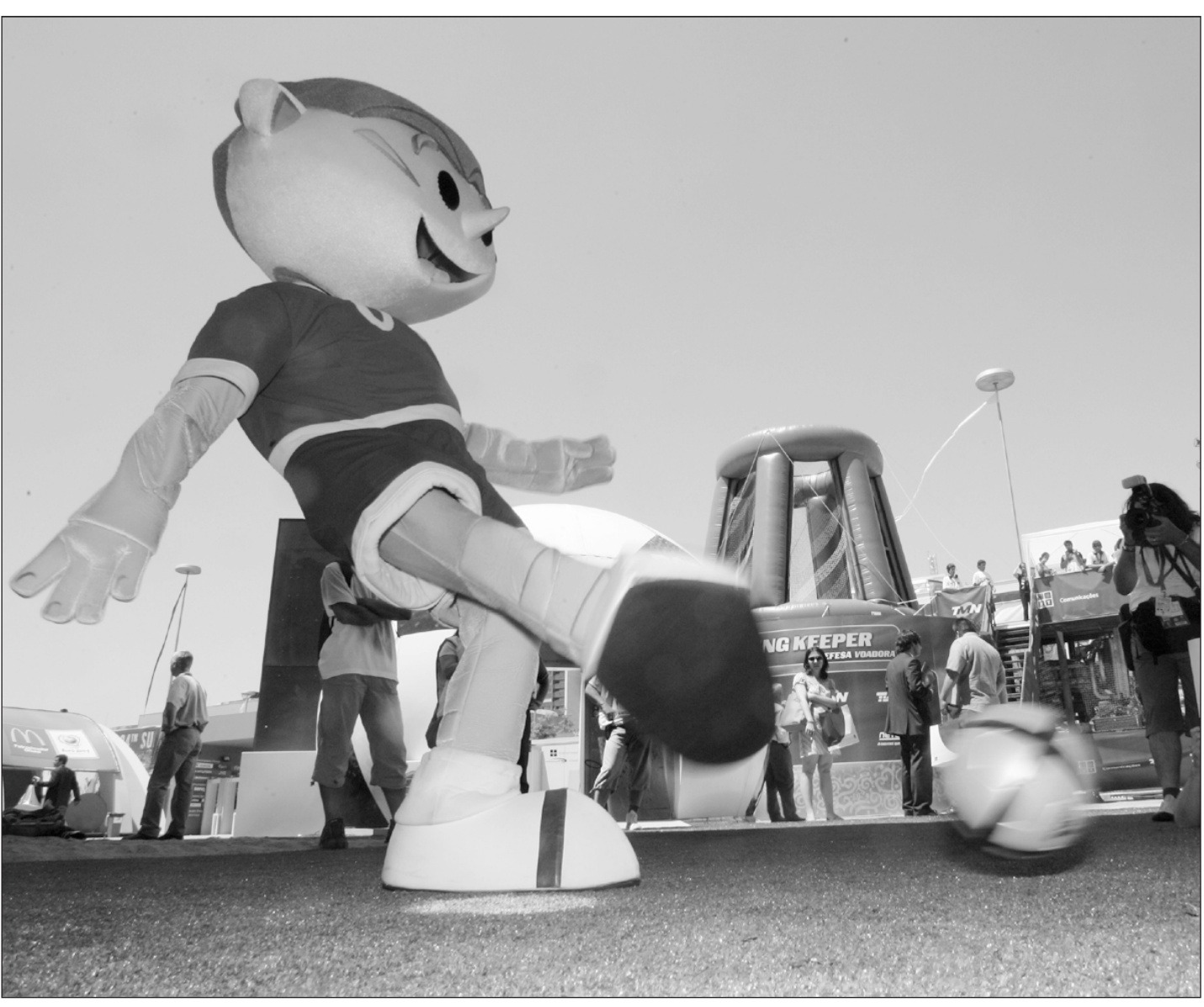
Euro 2004 mascot "Kinas" in action yesterday at the "Fan park" for football supporters.

Mohammedan Sporting Club made a flying start in the CJKS-Elite Paint Premier Division Football League when the holders blanked Kallol Sangha 3-0 in the opening match at the MA Aziz Stadium yesterday. The local giants struck all the scores in the first half.