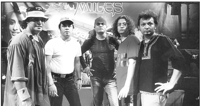
The Miles band members