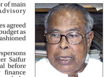
SEE PAGE 11 COL 1

Kibria said the budget has earmarked Tk 57,000 crore as expenditure