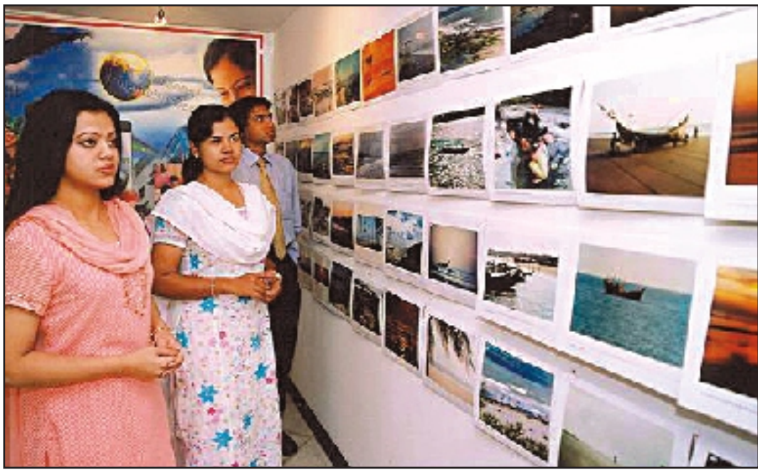
Visitors at the Second World Environment Day Photography Exhibition organised by the HSBC to mark the World Environment Day on its Gulshan Branch premises.

Relatives, friends and admirers have been requested to attend the qulhwani.