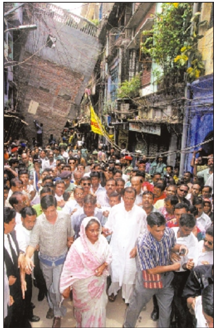
Leader of the Opposition in Parliament and Awami League President Sheikh Hasina visited the building that collapsed at Shankhari Bazar in Old Dhaka in the early hours of yesterday.

A panel of judges will select three winners from among the photographs displayed in the exhibition. HSBC will award three best photographers with a prize money of Tk 50,000.