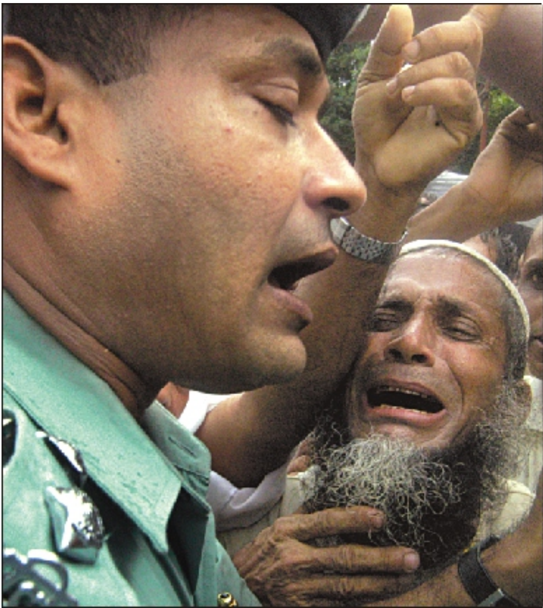
An elderly teacher breaks down in tears after police intercepted a procession of non-government primary teachers who were marching toward the Jatiya Sangsad yesterday to submit a memorandum to the Speaker demanding nationalisation of their service.