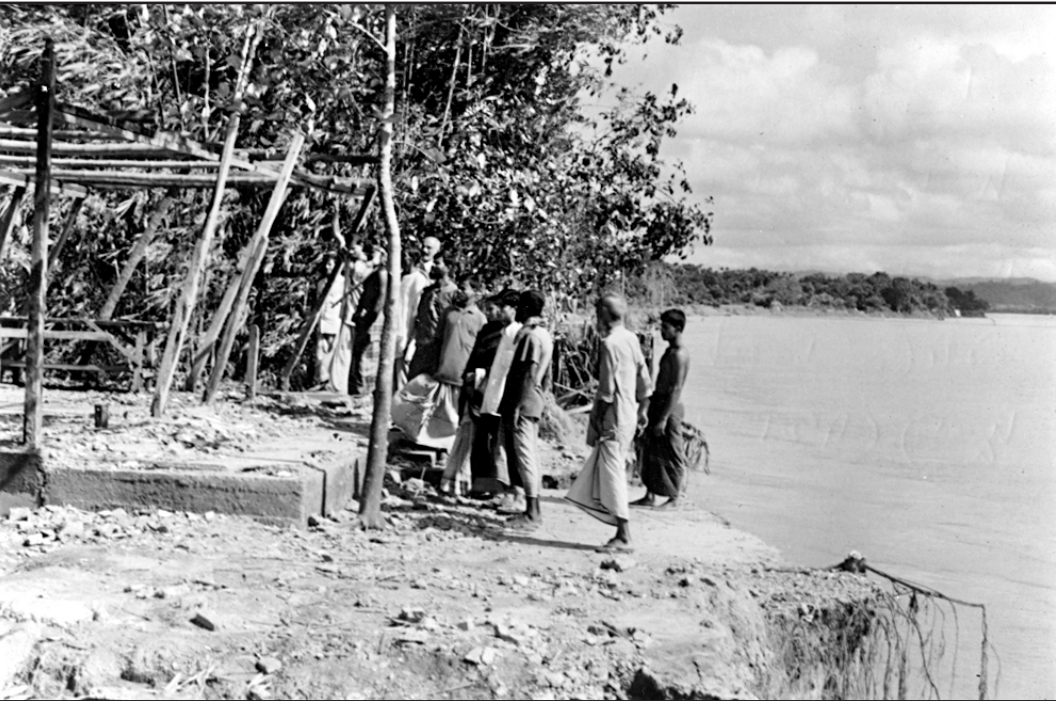
Villagers dismantling a house at Shibganj bazaar in Durgapur upazila, Netrakona where river erosion has taken an alarming turn in recent days.