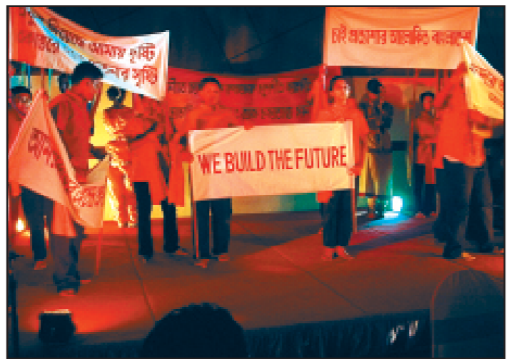
A view of the programme: conserving children's right

The magician and his assistant would then change places, Houdini appearing behind the curtain as the assistant disappeared into the box. The assistant would then emerge from the box and sack wearing a different costume.