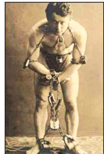
Ehrich Weiss - later Harry Houdini - was born in Budapest in 1874.

The Metamorphosis trick uses a device known as the substitution trunk, which has a secret panel that allows its occupant to sneak out. Having extricated himself from the sack in which he was tied, Houdini would climb out of the hidden door and crouch behind a