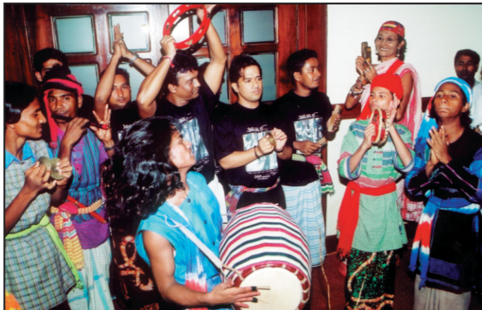
Bibi Russell (2nd from right) holds the centre stage with the participants

SHP is a unique, two part cultural exchange between Bangladeshi and Cuban children (aged between 6 to 14) that encourages positive practices to nurture the children's potential from diverse cultural backgrounds. The media is fusion theatre. SHP recently arranged a benefit dinner for raising funds for the Bangladeshi children who will participate in the 8th World Children Amateur Theatre Festival 2004 to be held in Cuba from July 19 to 25 with the theme of 'the performing arts across cultural boundaries'. 'Children are the hope of the world', said the Cuban national hero, José Martí. Therefore the symbolic word of the