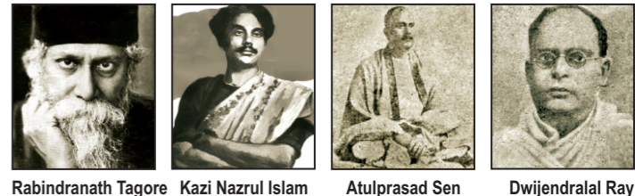
Rabindranath Tagore Kazi Nazrul Islam Atulprasad Sen Dwijendral Ray

The songs of Rabindranath Tagore and Kazi Nazrul Islam have always remained more popular in Bangladesh than other genres of music. These songs have distinct characteristics: Rabindra Sangeet bears sensitive lyrics that express major human feelings of love and desire, loneliness and dejection. On the other hand, Nazrul Sangeet also contains wonderful lyrics that are put into classical-based melody.