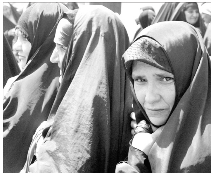
Discrimination against Women.

Rights lawyers reportedly voiced doubt, however, that the law would pass the Guardian Council, an unelected panel dominated by Islamic hard-liners. The constitutional watchdog has rejected several laws promoting equality between the sexes. Last year it refused to ratify the Parliament's proposal to accede to the U.N. Convention on the Elimination of All Forms of