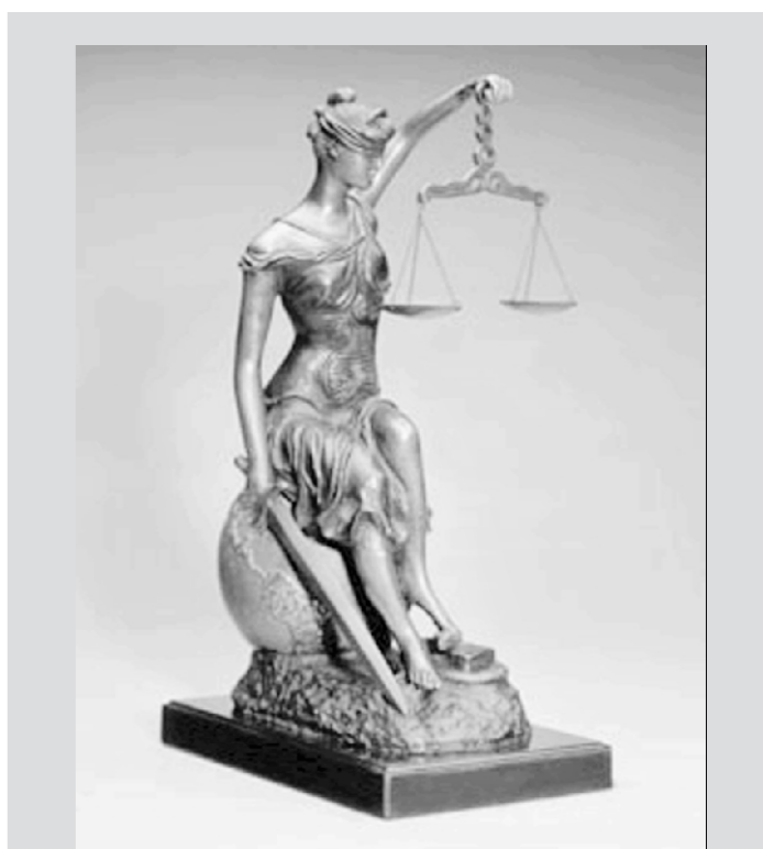
This week your advocate is M. Moazzam Husain of the Supreme Court of Bangladesh. His professional interests include civil law, criminal law and constitutional law.