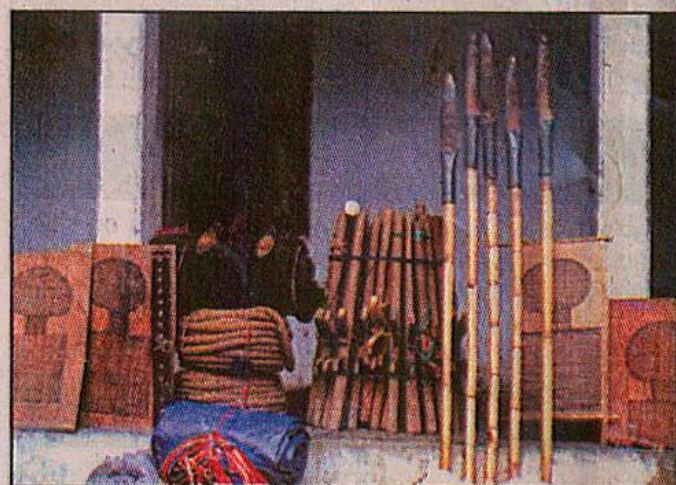
Wooden dummy AK-47 rifles, spears and other equipment found at a seizure list after police raided an Islamist arms training camp in Hathazari in Chittagong yesterday.