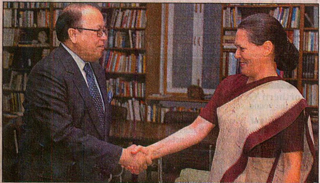
Foreign Minister Morshed Khan, left, shakes hands with India's Congress President Sonia Gandhi, right, in a meeting in New Delhi yesterday. Morshed met various government figures discussing insurgency and interlinking of rivers.