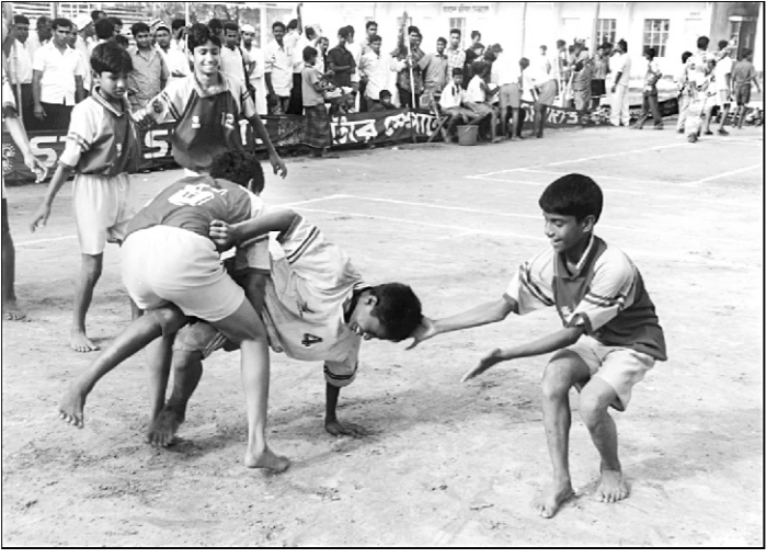
Action from yesterday's 12th schools kabadi tournament match between Nawabpur High School and Mannan High School at the Outer Stadium kabadi court.

UNB, Dhaka Ansars and VDP School, Nawabpur High School, Maniknagar Government Primary School and Shaheed Nabi High School moved into the semifinals of the 12th schools kabadi tournament yesterday. Ansars and VDP will face Nawabpur while Maniknagar play against Shaheed Nabi in the semifinals at the Outer Stadium kabadi court today. In yesterday's matches, Nawabpur High registered a massive 104-34 victory over Mannan High School while Maniknagar Government Primary recorded a facile 90-52 win over JB Memorial Academy. Ansars and VDP edged past Haidar Ali High School 88-74 and Shaheed Nabi High snatched an exciting 66-65 victory over Dolairpar High School. The final is slated for Thursday.