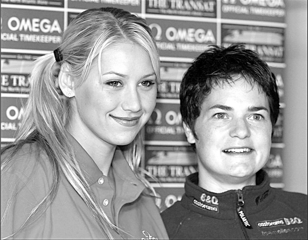
Russian tennis star Anna Kournikova (L) and internationally-renowned British sailor Ellen MacArthur pose for photographers before they start the Transat Race in Plymouth, England yesterday.