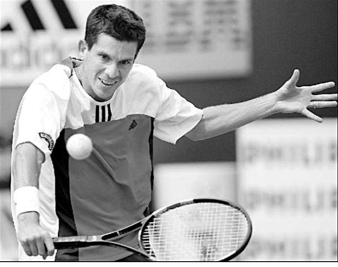
Briton Tim Henman hits a backhand for Frenchman Michael Llodra in the fourth round of the French Open on May 30.

The gloom for French fans deepened when Nicolas Escude pulled out of his match against third seed Guillermo Coria with an injured shoulder having lost the opening set 6-0. France's Olivier Mutis had already been beaten 4-6, 6-2, 7-6, 6-2 by Juan Ignacio Chela, the Argentine Henman plays next. However, women's third seed Amelie Mauresmo provided some much-needed cheer for home fans. The Frenchwoman smashed Magdalena Maleeva 6-2, 6-1 to reach the quarterfinals here for the second successive year. Mauresmo has suffered from crippling nerves at her home Grand Slam in the past but on Sunday played a sublime match to line up a showdown with Russia's Elena Dementieva. Ninth seed Dementieva pum-