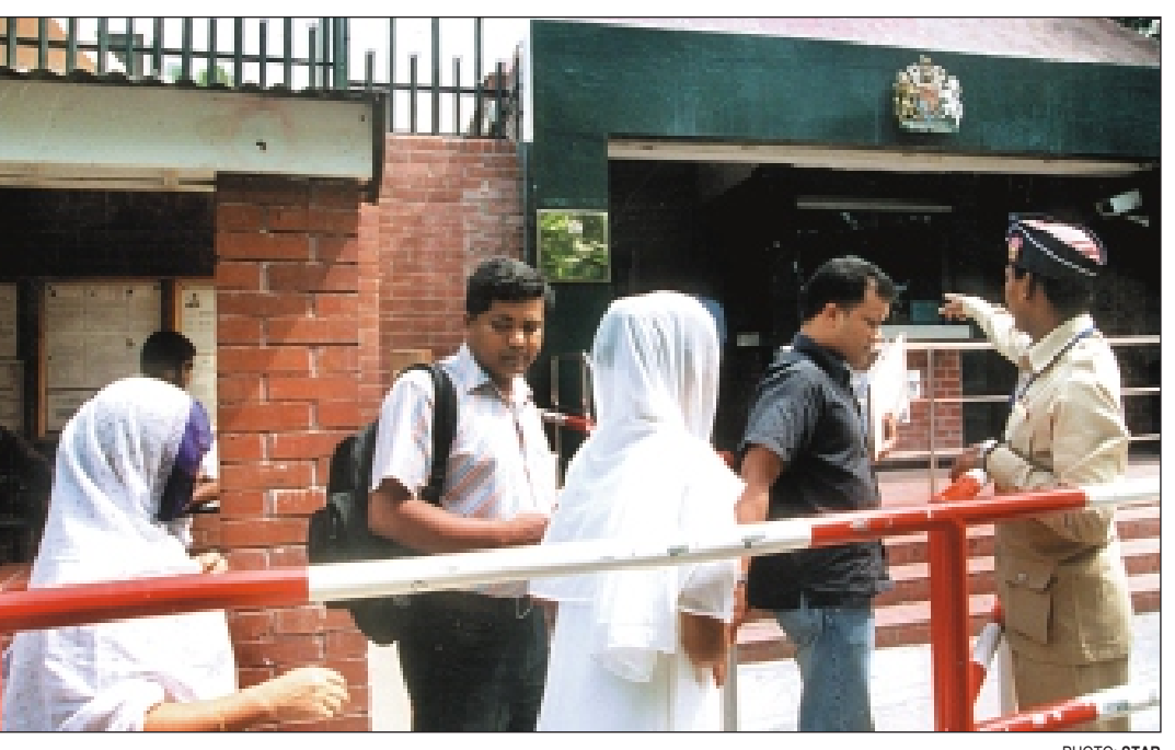
The British High Commission in Dhaka yesterday resumes receiving visa applications for the first time after Friday's bomb attack on the UK envoy in Sylhet.

In Haiti, 100 people were killed in Fonds Verette, northeast of Port-au-Prince, a parish priest told Radio SEE PAGE 11 COL 7