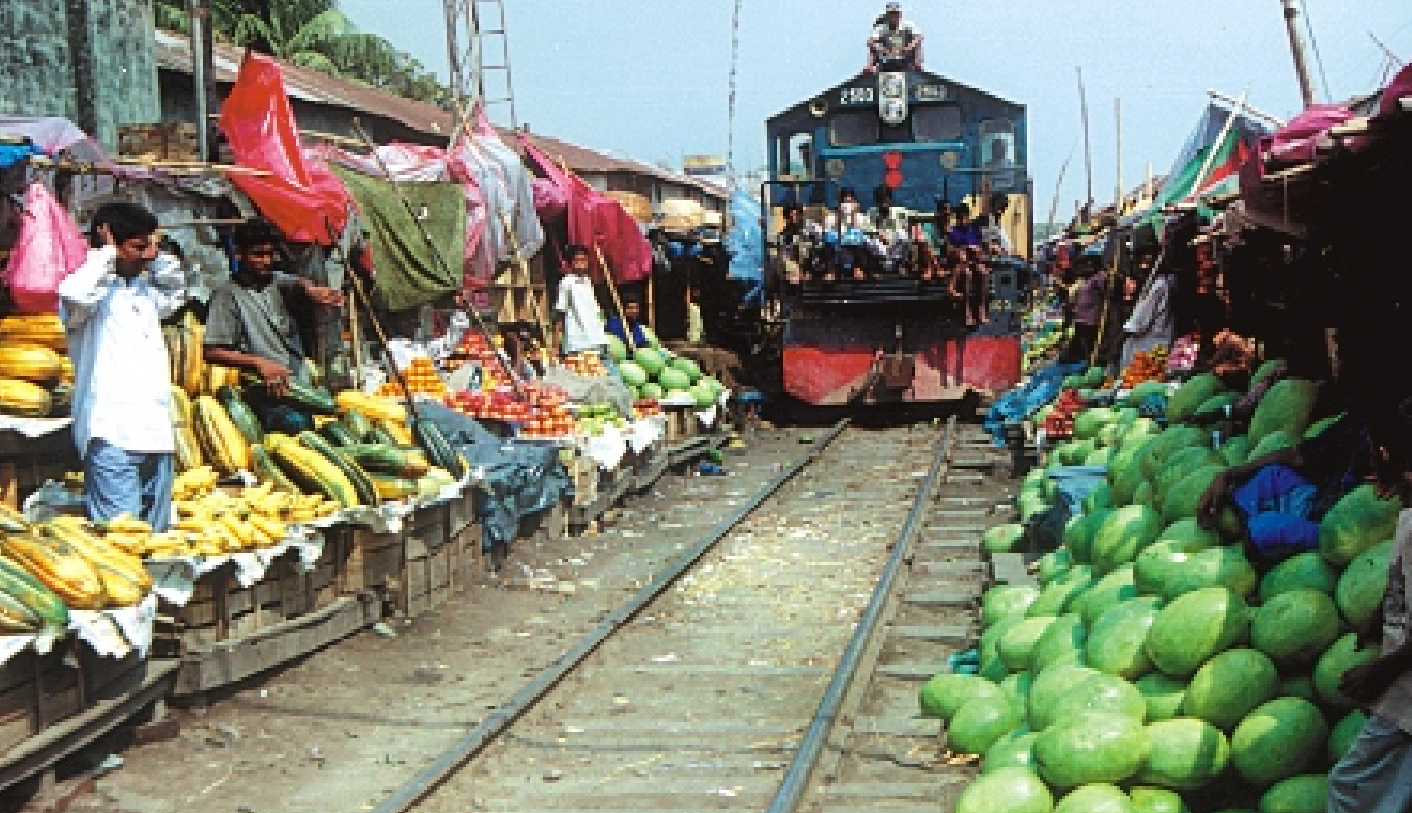
encroachers proved futile.