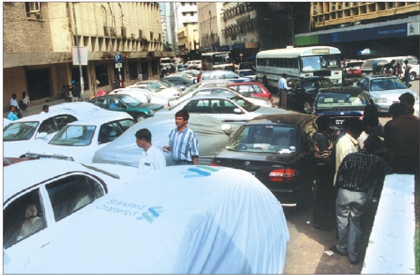
Randomly parked cars close to Purbani Hotel in Motijheel create traffic chaos on the road in the busy commercial capital.

Rupsha police failed to nab anyone till 6:30 yesterday evening.