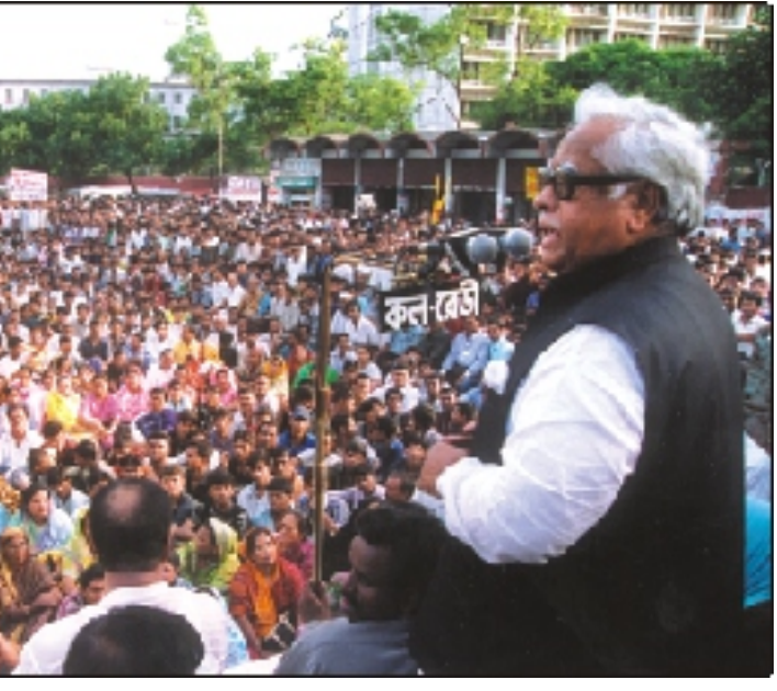
Awami League General Secretary Abdul Jalil addresses a public meeting at Muktangan in the city yesterday protesting the bomb attack at the Shrine of Hazrat Shahajalal in Sylhet. The AL organised the meeting.

OUR CORRESPONDENT, Magura A court in Magura yesterday awarded life-term rigorous imprisonment (RI) to four youths and fined them Tk 20,000 each in default to suffer one year more RI in a murder case.