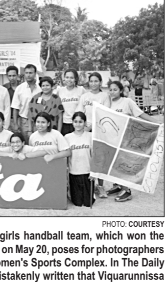
Players and officials of Scholastica's girls handball team, which won the Bata 14th School Handball Tournament on May 20, poses for photographers after the triumph at the Dhanmondi Women's Sports Complex. In The Daily Star Sport's issue on May 21, it was mistakenly written that Viquarunnissa Noon School won the championship.

Today's Cryptogram Clue: D equals M. Yesterday's Cryptogram: WHEN A PRINCESS GETS A POUNDING HEADACHE, WOULD YOU SAY THAT'S A ROYAL PAIN? The Cryptogram is a substitution cipher in which one letter stands for another. If you think that X equals O, it will equal O throughout the puzzle.