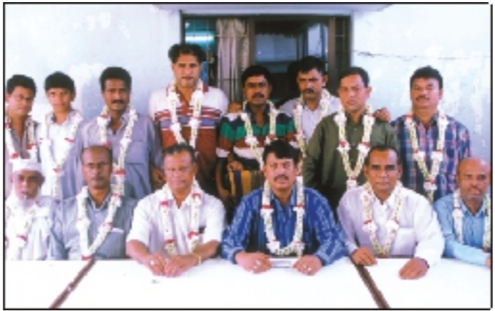
The installation ceremony of newly elected executive committee of Karwan Bazar No. 2 Group Kancha Maler Arat Malik Baybasyee Bahumukhi Samabaya Samity was held in the city on Saturday.