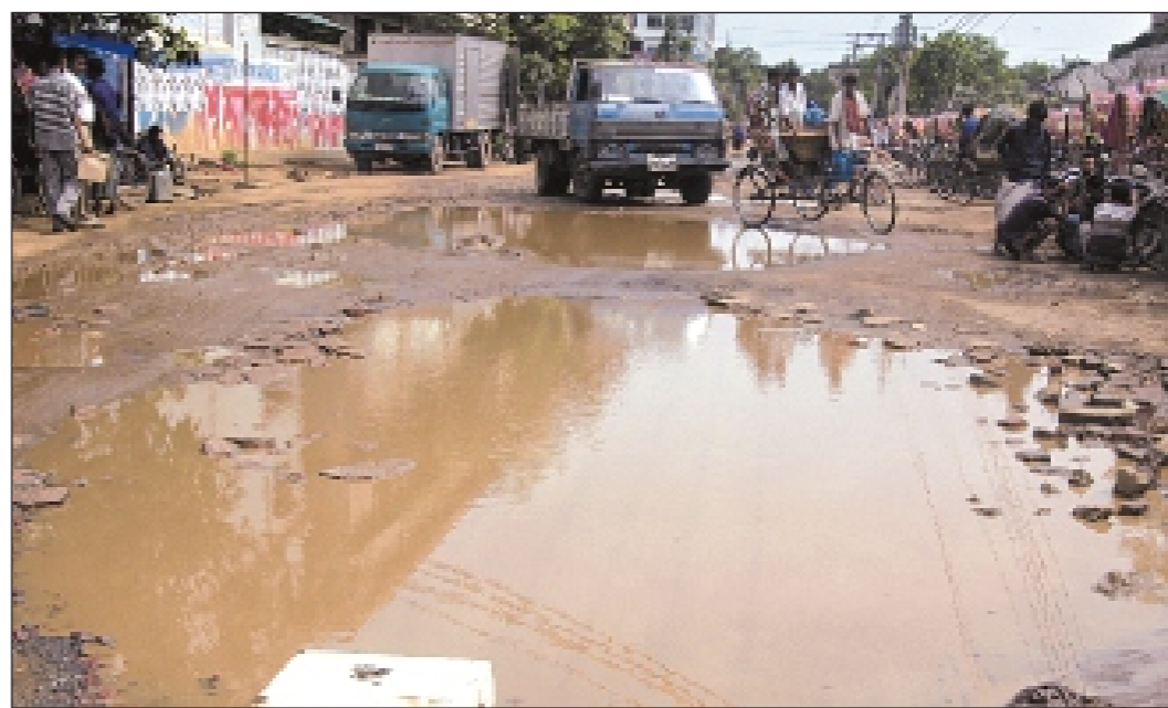
About half a kilometre road of north Begunbari in Tejgaon industrial area has developed craters due to long neglect, affecting business.