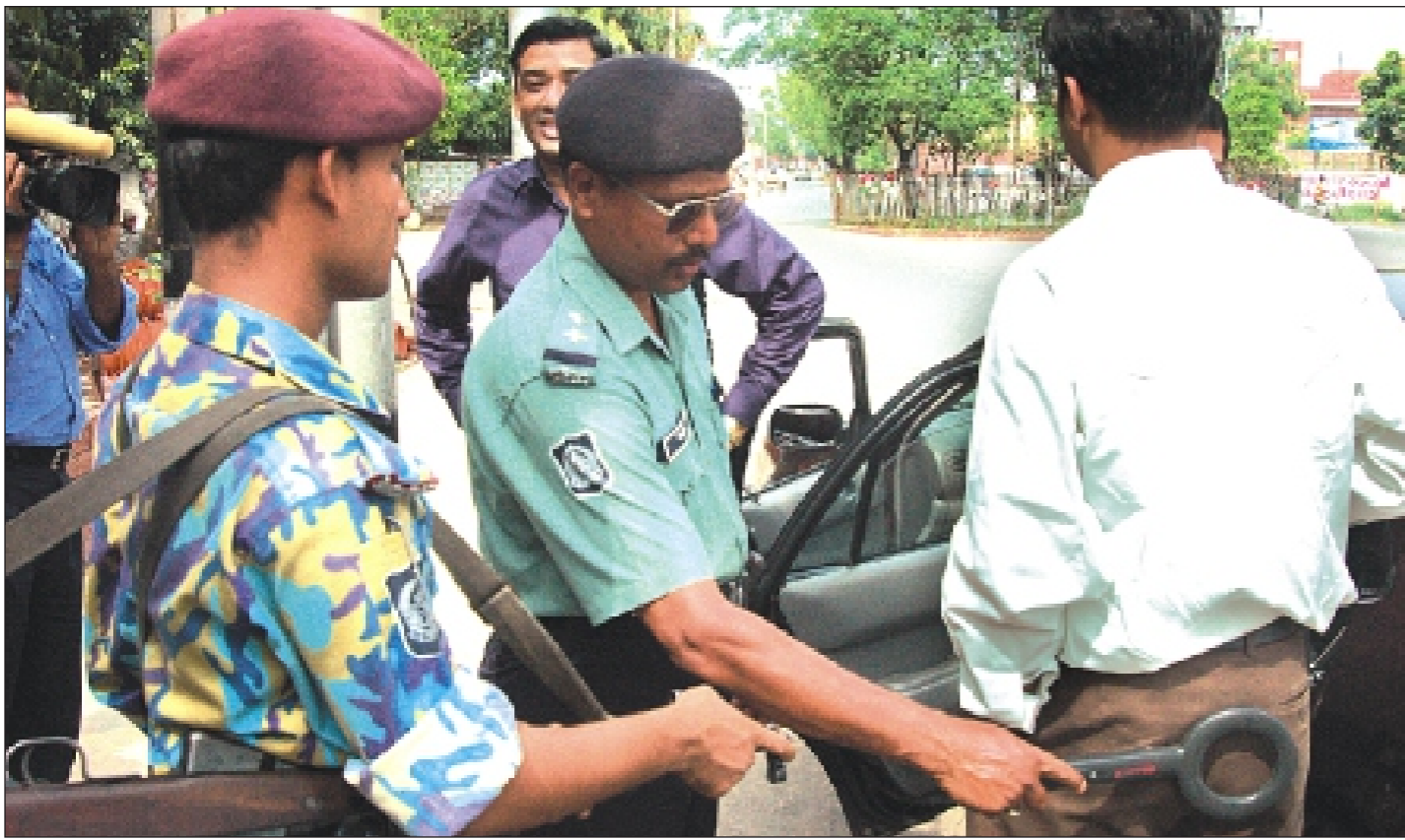
Car passengers face a check with metal detector before entering the diplomatic enclave in Baridhara yesterday.