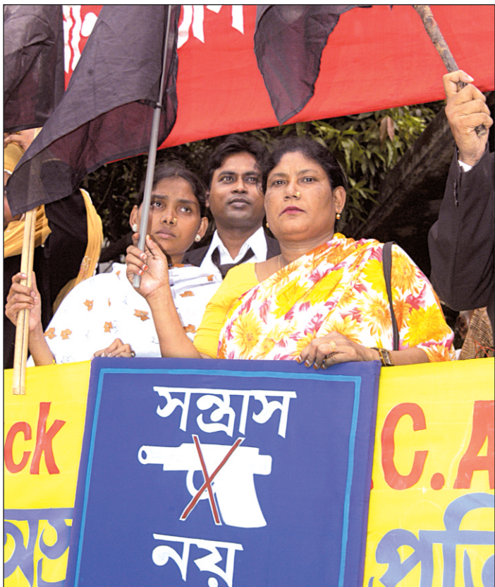
Members of the Sylhet Division Development Parishad hold a rally at Muktangan yesterday to protest against the bomb attack at Shahjalal shrine Friday.