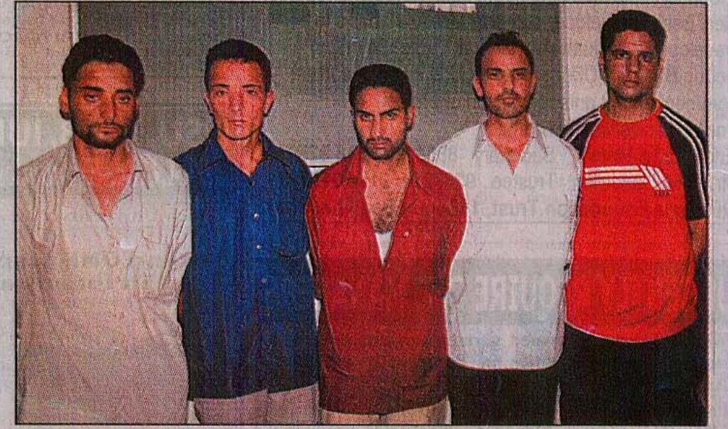
Five Indian nationals, who holed up in a Bangladesh Biman aircraft at ZIA, were arrested yesterday, 16 hours after the aircraft arrived from Hong Kong.