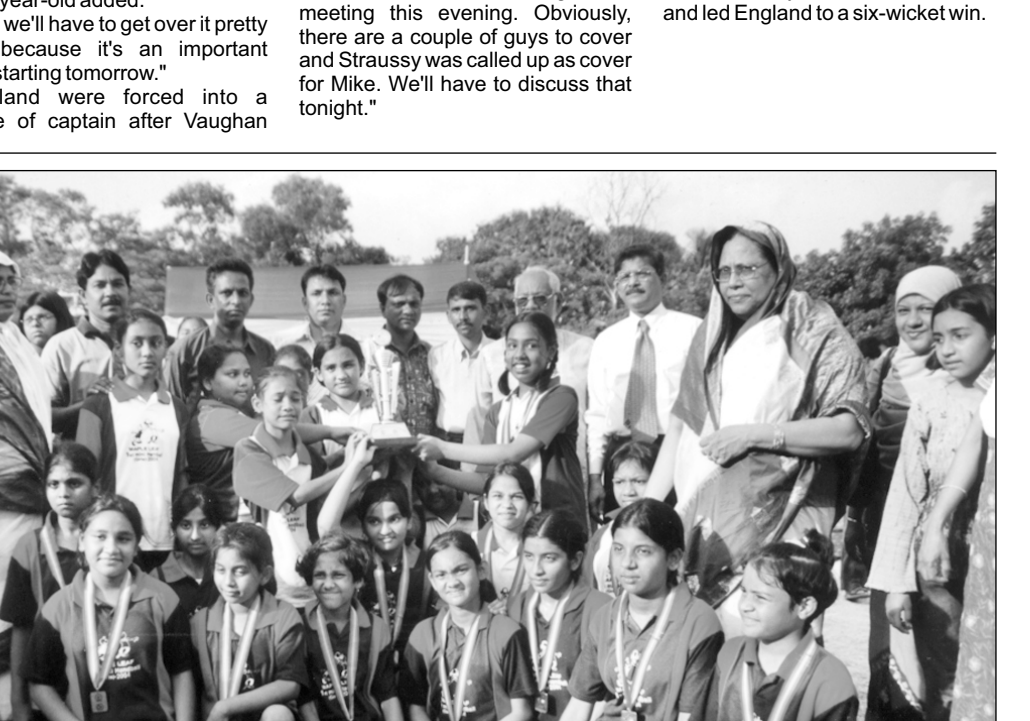
Players and officials of Maple Leaf International School pose for photographers after winning the mini handball tournament at the Dhanmondi Women's Sports Complex yesterday.