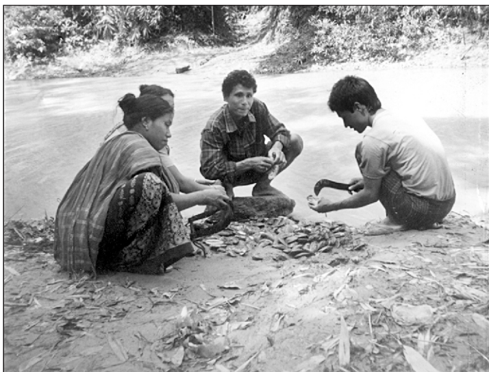
Pearl is being searched out from oysters on the bank of hilly river Mongalashowary at Gobindapur village in Kalmakanda upazila in Netrakona district (left) and children collecting oysters from a pond at Gopalpur village in Atpara upazila.

About one thousand people are engaged in pearl collection from waterbodies in Mymensingh region but they have no training.