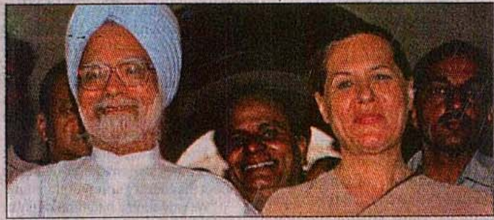
Sonia Gandhi with Manmohan Singh outside parliament yesterday.

Congressmen resign to protest Sonia's decision; distraught workers protest; regional group to join government