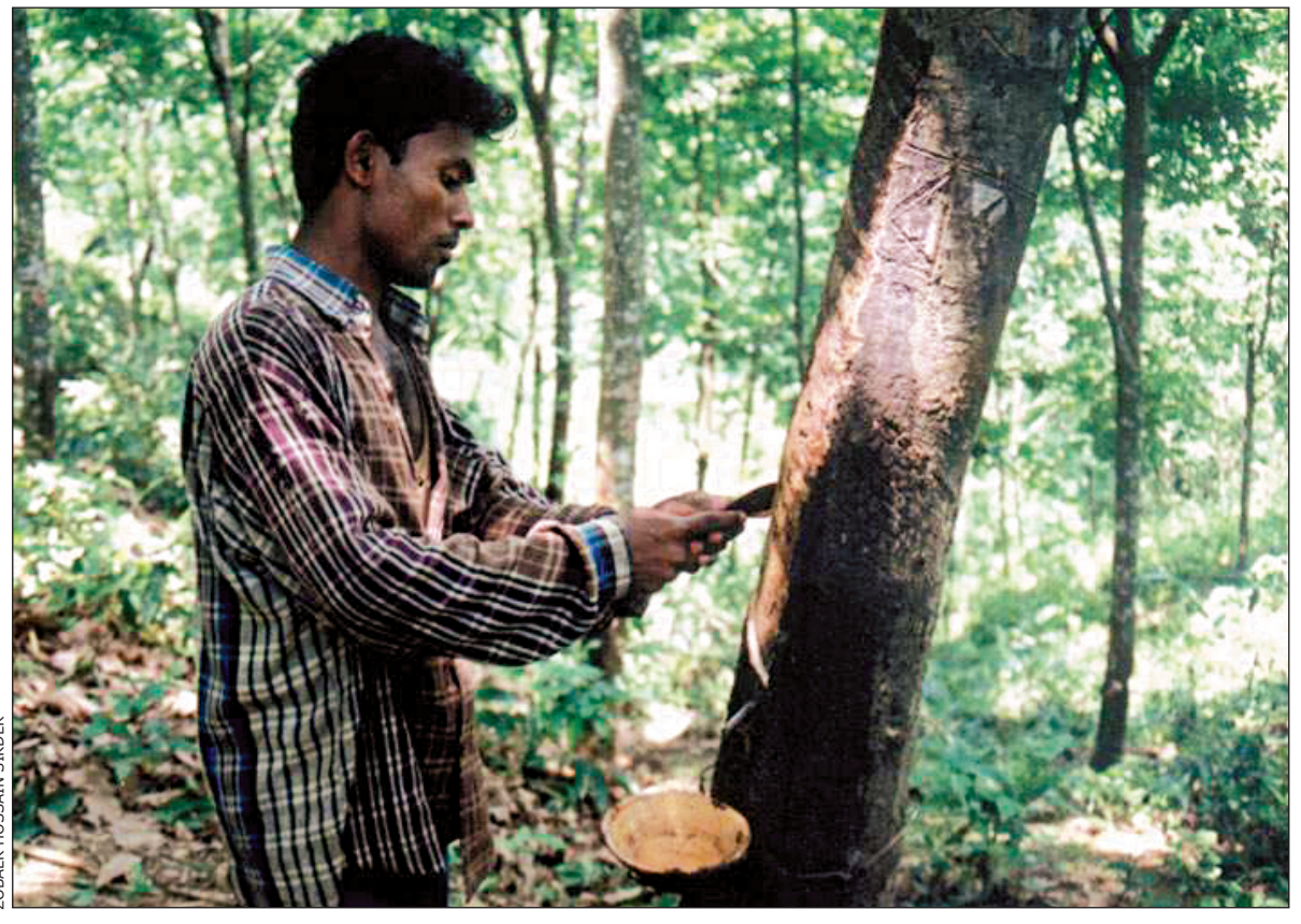
Rubber Garden: A worker slices the bark of a rubber tree to collect its milky sap used to make rubber at a rubber garden at Ramu in Cox's Bazar.