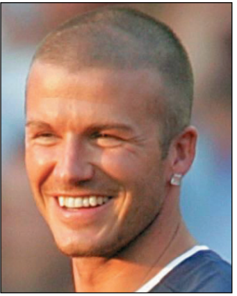
DAVID BECKHAM top of the Primera Liga, handing the title to Valencia. Beckham's private life became the stuff of media frenzy in April

hopes of a league, cup and Champions League treble. Then they were dumped out of the Champions League quarterfinals by Monaco and surrendered an eight-point lead at the