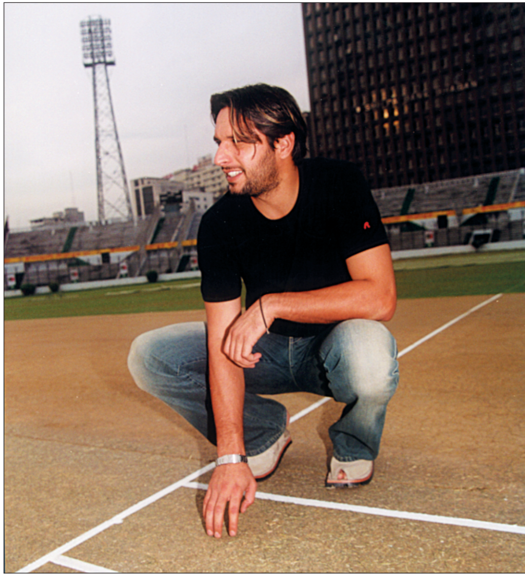
IF THE BALL LANDS HERE, I'LL BE GONE! Dashing Pakistani cricketer Shahid Afridi, who came here to play for ARAF Apparels in the GrameenPhone Corporate Cricket League, poses for photographs on the pitch of the Bangabandhu National Stadium yesterday.